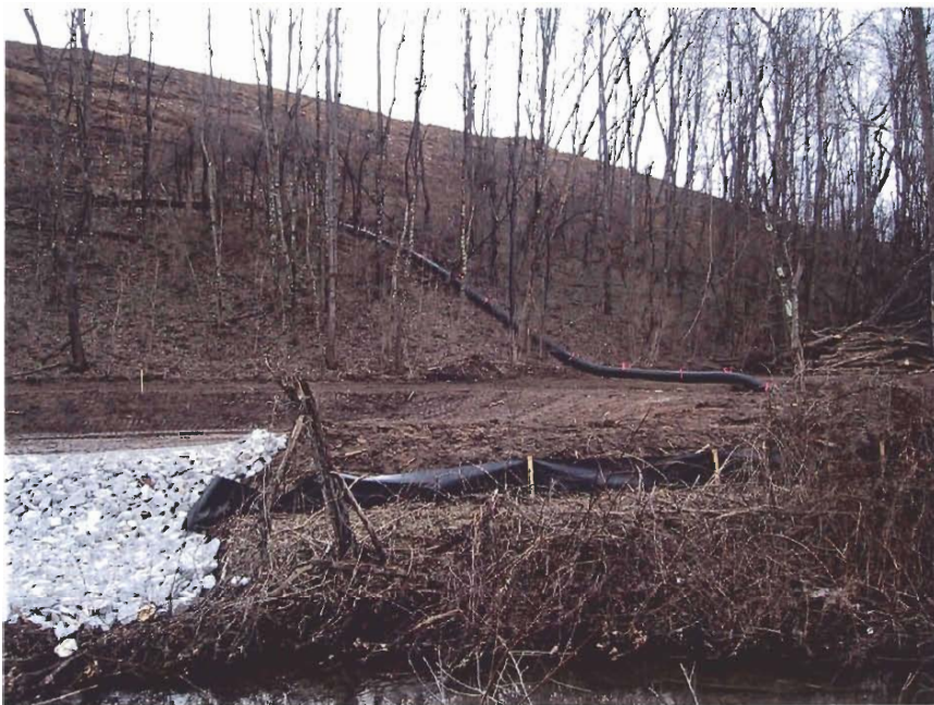
Temporary Slope Pipe to Sediment Trap #3