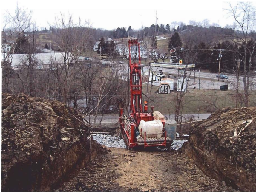
Geotechnical Drilling Operation