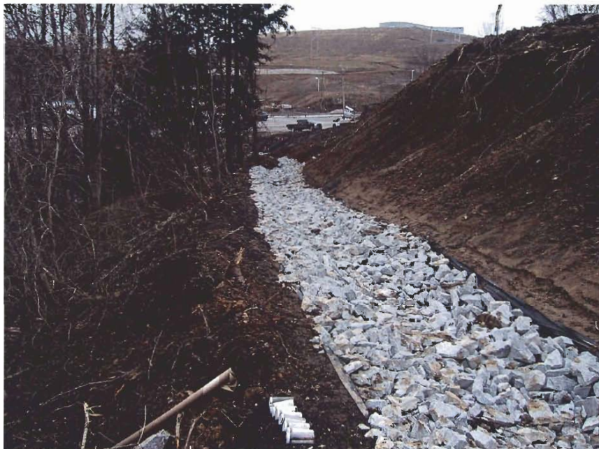
Temporary Ditch #3