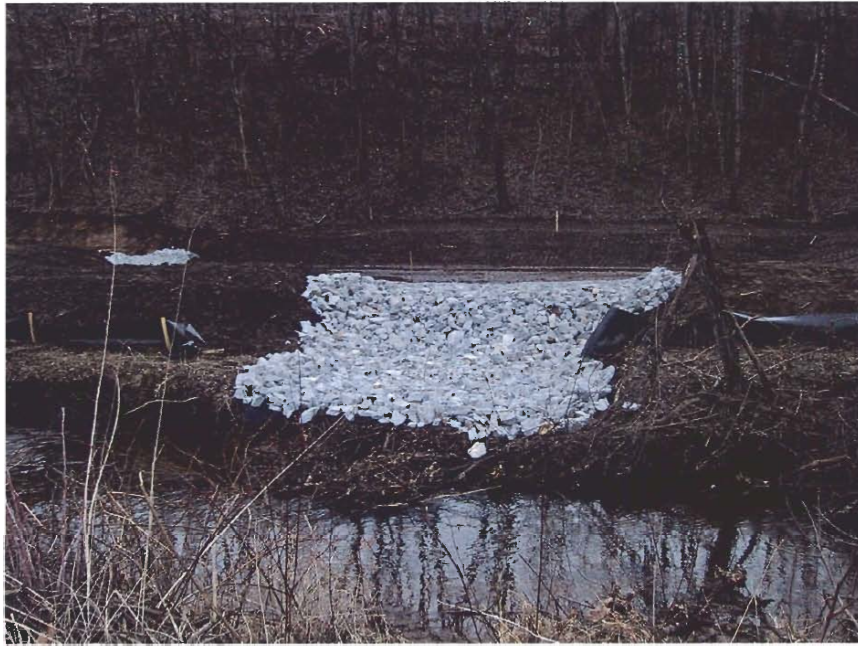
Sediment Trap #2 with Rock Filter Outlet