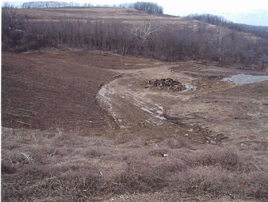
Designated Waste Area