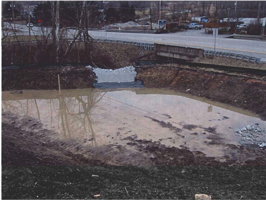
Sediment Trap #1