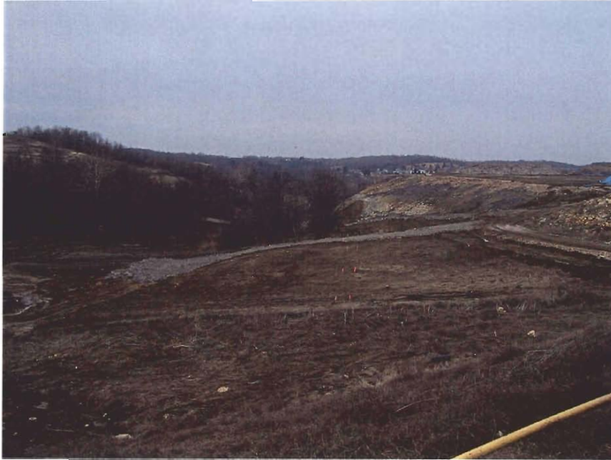
Project Site looking from Wayland Smith Dr. with the access road to the waste area visible.

PROJECT PHOTOS TAKEN FEBRUARY 1, 2007 THROUGH FEBRUARY 28, 2007