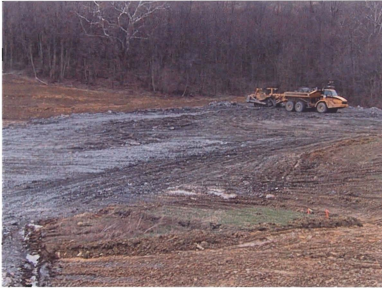
Rock Base Placed in Controlled Waste Area