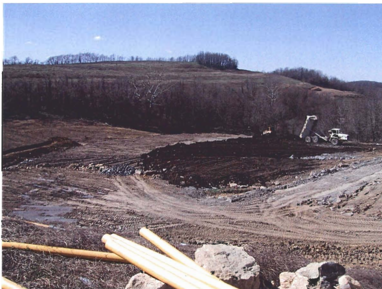
Earth Layer Placed on Rock in Controlled Waste Area