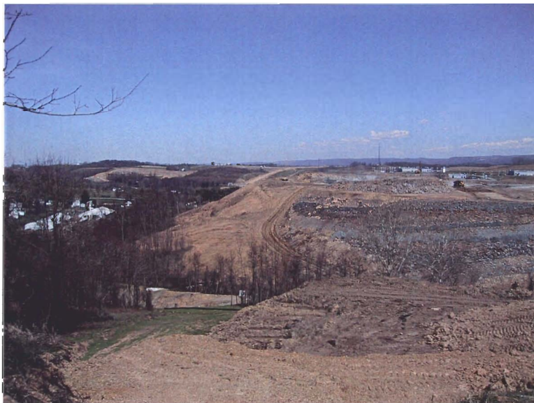
Project Site looking from Topsoil Stockpile Area