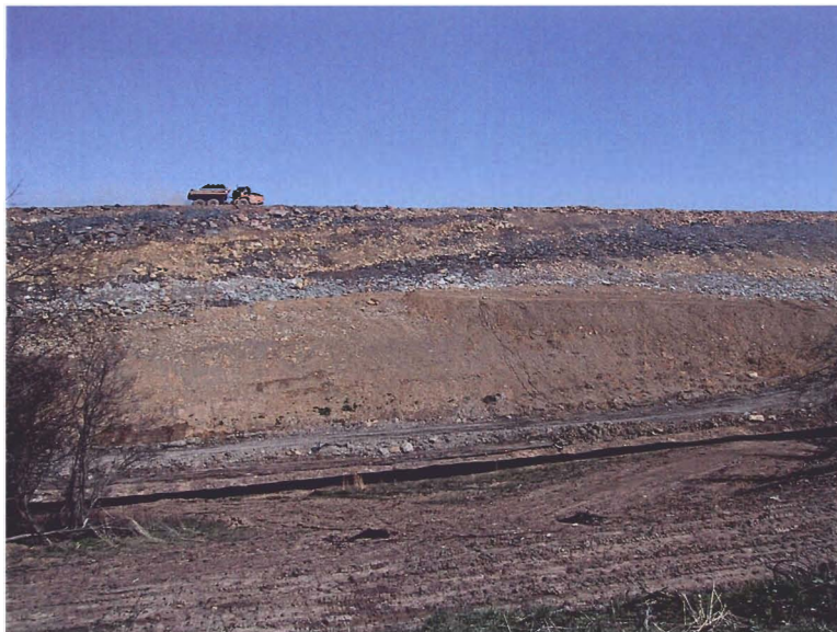
Transporting Material to Waste Area