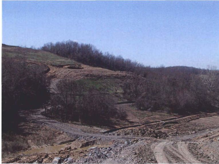
Topsoil Stockpile Area