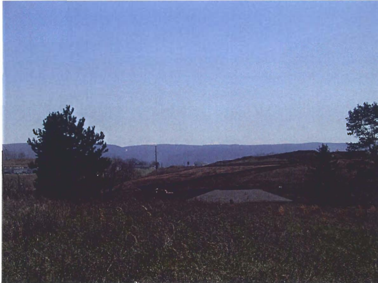
Project Site looking from Duck Hollow Rd.

PROJECT PHOTOS TAKEN MARCH 1, 2007 THROUGH MARCH 31, 2007