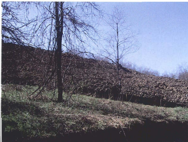
Topsoil Stockpile Area