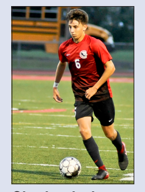
Charleroi wins The Cougars blasted Yough, 8-1. B1