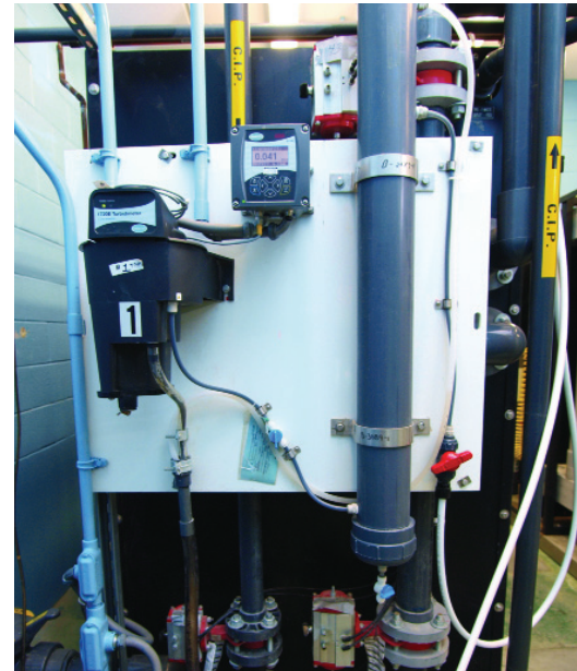
Ohiohyle's water treatment facility uses sophisticated membrane filtration technology to guarantee clean water for residents and tourists.

Over the past several years, the Redevelopment Authority has worked cooperatively with Brownsville Borough to implement the Brownsville Borough Targeted Revitalization Initiative, aimed at aggressively addressing the blight in the Borough's downtown area. In 2008 the Redevelopment Authority was able to facilitate another bold step in the initiative, working with the County Commissioners to approve the Brownsville Redevelopment Proposal. This Proposal involves the acquisition of several properties and the implementation of additional enhancements in order to help alleviate some of the severe blight which exists in the Borough. Funding for the project was obtained by the Redevelopment Authority through a $2.0 million grant provided through the Pennsylvania Main Street Growing Greener II program.