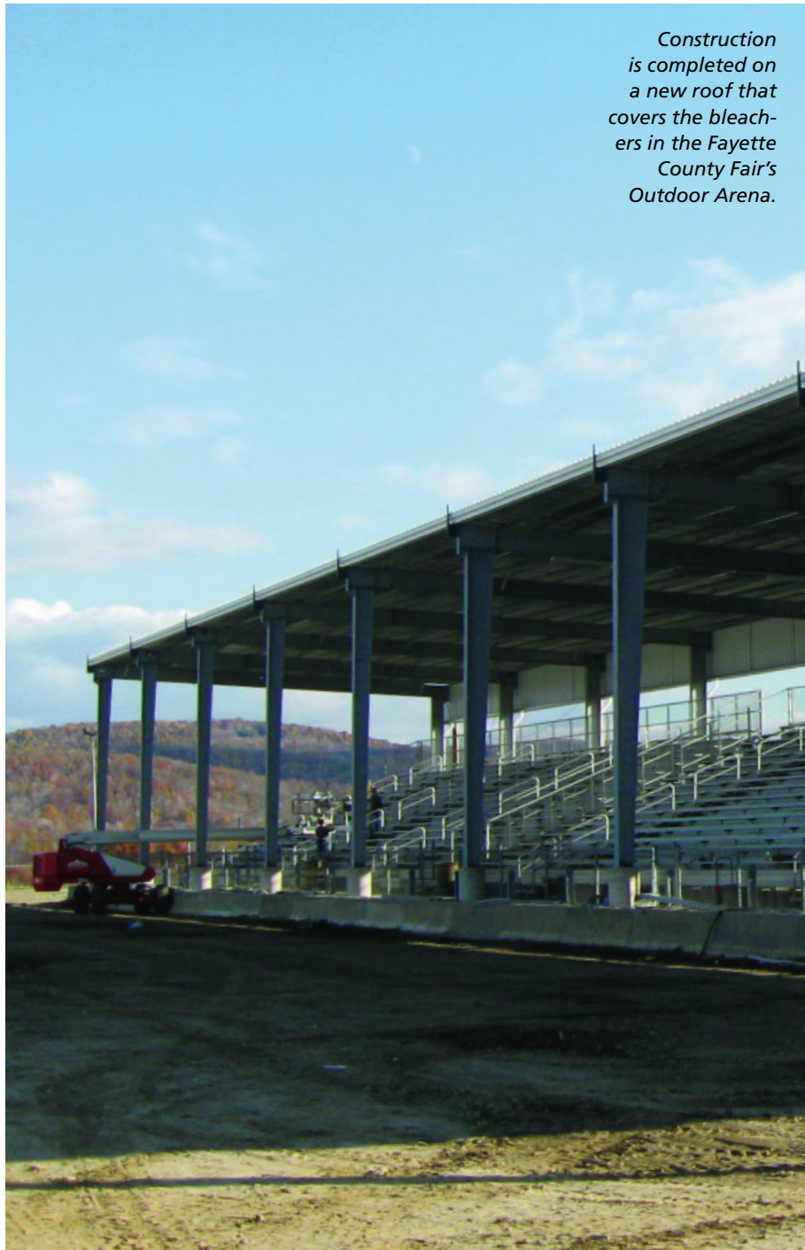
Construction is completed on a new roof that covers the bleachers in the Fayette County Fair's Outdoor Arena.