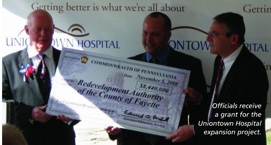
Officials receive a grant for the Uniontown Hospital expansion project.

With attendance at the Fayette County Fair close to 100,000 people, it's not surprising that events at the Fair's Outdoor Arena often attract large crowds. In order to support these popular events and to accommodate fair patrons, the Fayette County Fair Board partnered with the Redevelopment Authority and other local officials to apply for a $450,000 grant through the Pennsylvania Redevelopment Assistance Capital Program. The proceeds from this grant were used to construct a roof over the Outdoor Arena so that patrons can enjoy events during inclement weather. The grant also supported the construction of a press/announcers box, allowing reporters and announcers to safely view events.